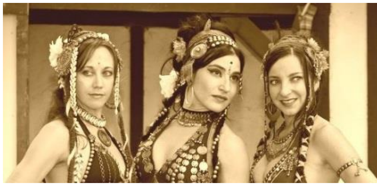
Lord and Lady Delgado, the contest & the trio of thieves