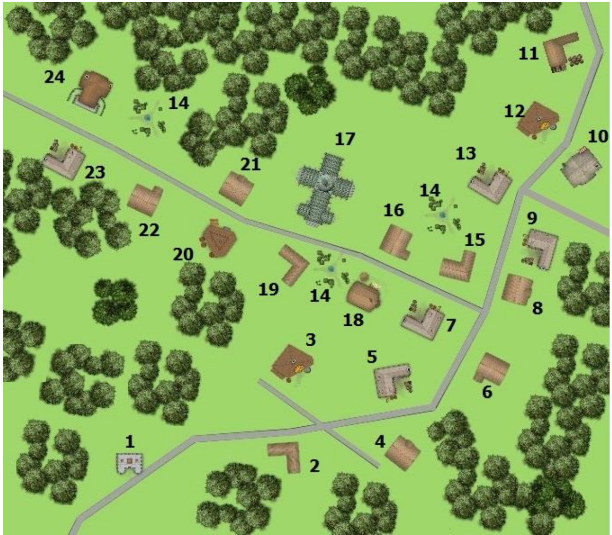
Community of Penchant <above> street vendor <below>